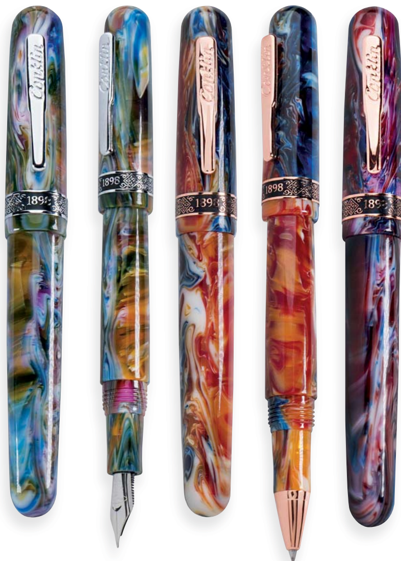
From left—Conklin 1898 Misto green fountain pen, capped and uncapped, with chrome-plated rocker clip, cap band with “1898” engraving, and stainless steel nib with crescent-shaped breather hole; 1898 Misto orange rollerball, capped and uncapped, with rose gold-plated trim; 1898 Misto fountain pen in purple resin with rose gold-plated trim.

Visit conklinpens.com and yafabrands.com