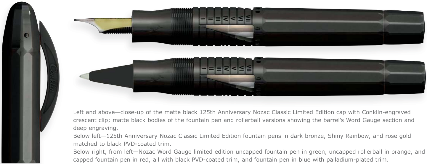
Left and above—close-up of the matte black 125th Anniversary Nozac Classic Limited Edition cap with Conklin-engraved crescent clip; matte black bodies of the fountain pen and rollerball versions showing the barrel's Word Gauge section and deep engraving.