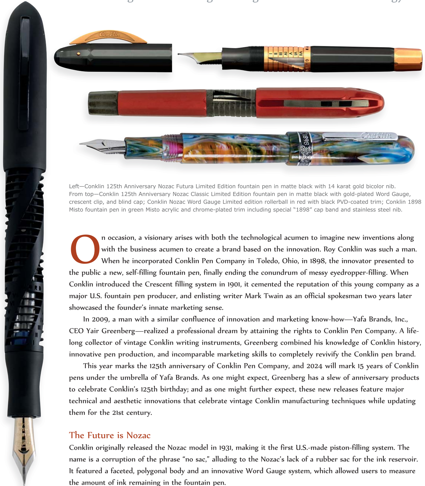
Left—Conklin 125th Anniversary Nozac Futura Limited Edition fountain pen in matte black with 14 karat gold bicolor nib. From top—Conklin 125th Anniversary Nozac Classic Limited Edition fountain pen in matte black with gold-plated Word Gauge, crescent clip, and blind cap; Conklin Nozac Word Gauge Limited edition rollerball in red with black PVD-coated trim; Conklin 1898 Misto fountain pen in green Misto acrylic and chrome-plated trim including special “1898” cap band and stainless steel nib.

New releases celebrating the brand's 125th anniversary share the same DNA as vintage Conklins: elegant design and innovative technology.