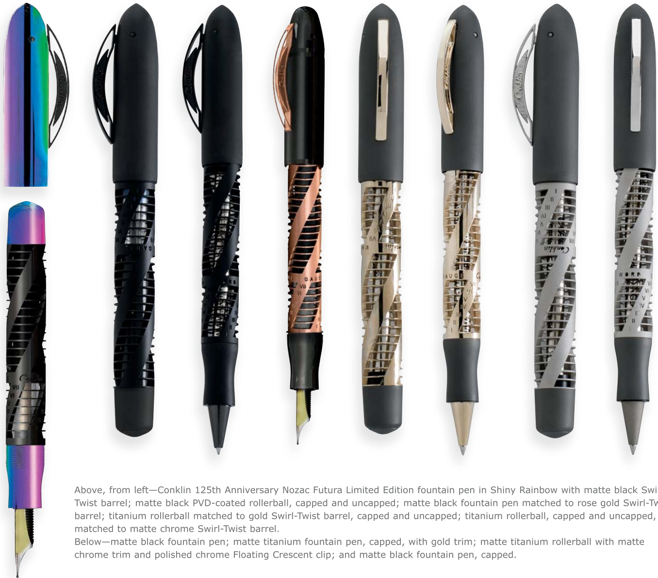
Above, from left—Conklin 125th Anniversary Nozac Futura Limited Edition fountain pen in Shiny Rainbow with matte black Swirl-Twist barrel; matte black PVD-coated rollerball, capped and uncapped; matte black fountain pen matched to rose gold Swirl-Twist barrel; titanium rollerball matched to gold Swirl-Twist barrel, capped and uncapped; titanium rollerball, capped and uncapped, matched to matte chrome Swirl-Twist barrel. Below—matte black fountain pen; matte titanium fountain pen, capped, with gold trim; matte titanium rollerball with matte chrome trim and polished chrome Floating Crescent clip; and matte black fountain pen, capped.

The new Conklin 125th Anniversary Nozac Classic Limited Edition collection writing instruments come in matte black bodies with matte black trim, limited to 55 fountain pens; matte black bodies with rose gold trim, limited to 70 fountain pens; matte rose gold bodies matched to black PVD-coated trim, limited to 40 fountain pens; matte dark bronze matched to black trim, limited to 55 fountain pens; and iridescent Shiny Rainbow bodies matched to palladium-plated trim, limited to 55 fountain pens. Each rollerball version is a limited edition of 15.